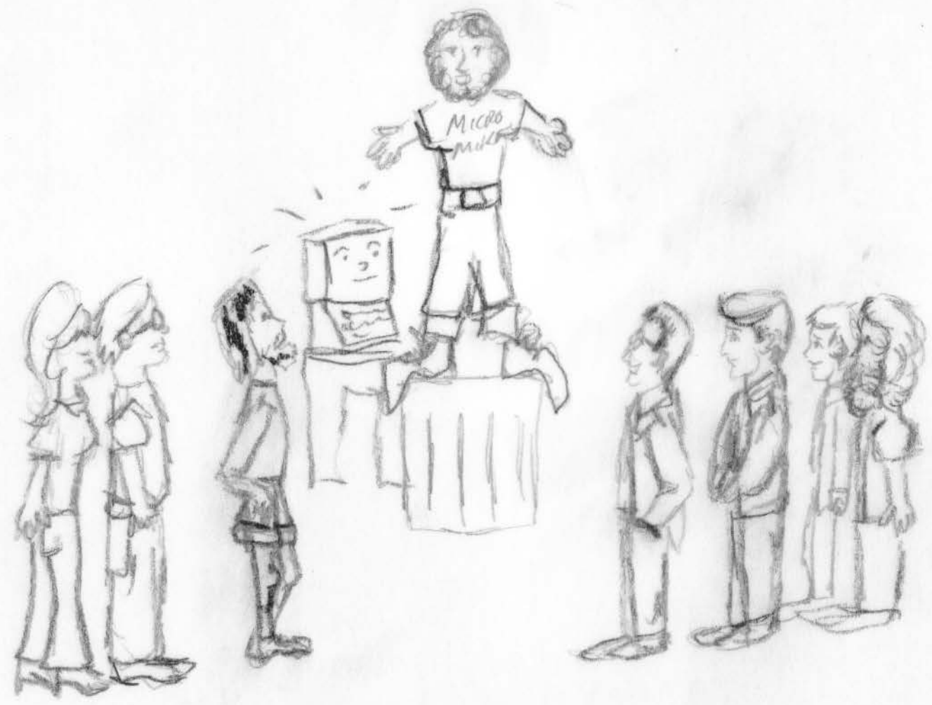
MICRO MIKE CALLED HIS FRIENDS AND GAVE THEM AN IMPASSIONED PLEA TO HELP FIGHT MR. BIG. THEY ALL AGREED AND FOUGHT WITH ALL THEIR COMPUTER KNOW HOW.